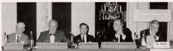
Second International Polydisciplinary Congress of O.E.S.O. Paris, June 24-25-26-27, 1987

In 1984, O.E.S.O. (Organisation Internationale d'Etudes Statistiques pour les maladies de l'Oesophage) organized its first Congress devoted to cancer of the esophagus, during which 135 questions were put to several dozen teams from 23 countries.