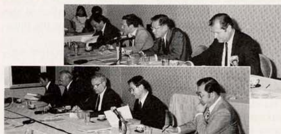
Discussion at Executive Committee

(3) The value for (Y) is so determined that B-members do not account for more than 25% of (X), the total number of